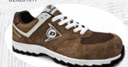
CASTANHO · MARRÓN · BROWN DL0201027