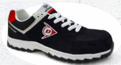
PRETO · NEGRO · BLACK DL0201018