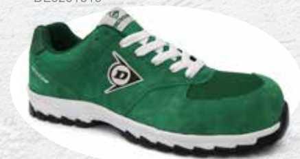
VERDE · VERDE · GREEN DL0201019