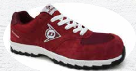
VERMELHO · ROJO · RED DL0201016