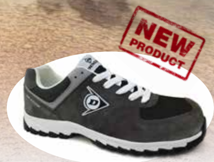
CARVÃO · CARBÓN · CHARCOAL DL0201040