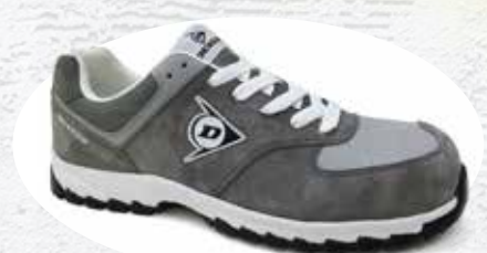
CINZA · GRIS · GREY DL0201017