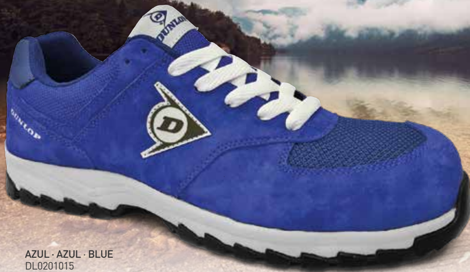
AZUL · AZUL · BLUE DL0201015